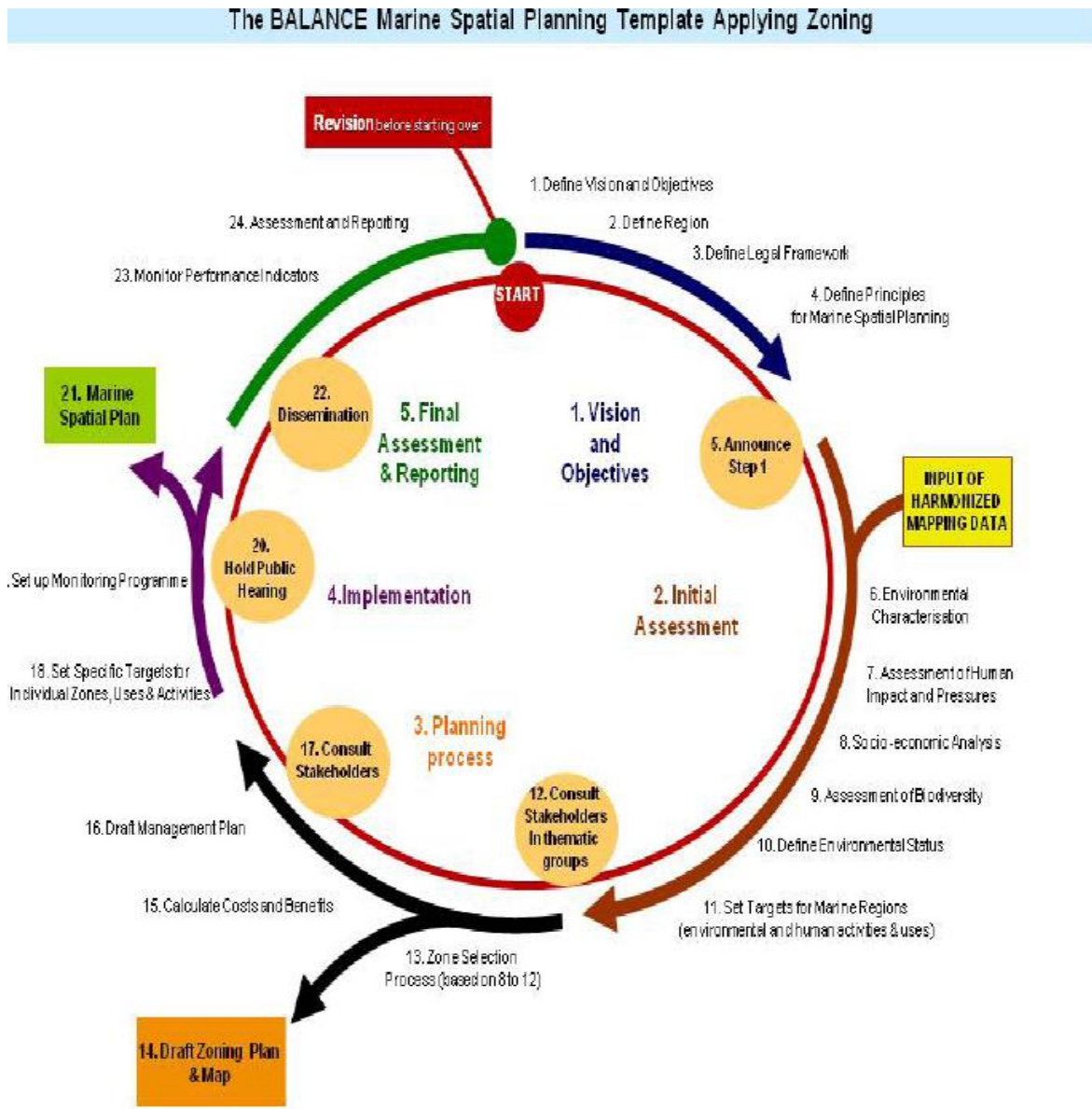
Fig. 2: The MSP planning cycle according to Balance (Balance Technical Report 4, no date)

Although it would be worth analyzing each of the steps shown in some detail, a simpler planning cycle is sufficient for the purpose of drawing up minimum requirements. The BaltSeaPlan vision 2011 ( www.baltseaplan.eu ) has defined a simpler planning cycle that is limited to the core elements of the MSP process (Fig. 3):